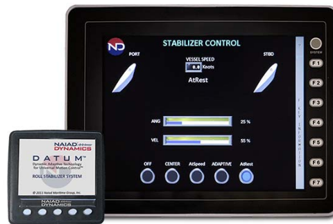
DATUM™ graphical display panel options, each with intuitive multi-page display screens.

Naiad Dynamics stands behind every system sold with its superb Limited Warranty. NAIAD® products are supported worldwide by our six sales and service centers and mobile fleet, and by our comprehensive Authorized Dealer Network with locations in key yachting regions for fastest response and guaranteed satisfaction. Spare parts are usually in-stock and ship within 24 hours, and our state-of-the-art in-house manufacturing facility ensures quick turnaround on parts throughout the life of the system.