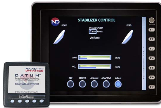
DATUM™ graphical display panel options, each with intuitive multi-page display screens.